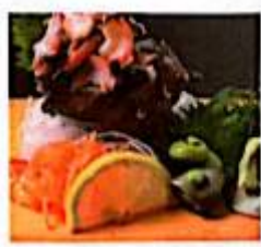
Turban shell 1475 yen