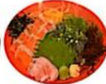
Salmon and whitebait Just a bowl 2040 yen Combo 2270 yen