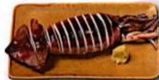
Squid 1500 yen