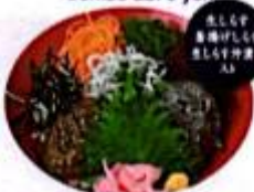
3 colored whitebait Just a bowl 1480 yen Combo 1710 yen