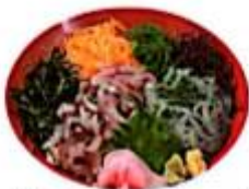
Horse mackerel and whitebait Just a bowl 1600 yen Combo 1830 yen