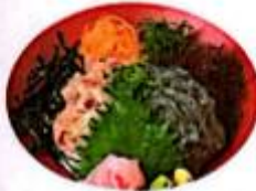
Filefish and whitebait Just a bowl 2040 yen Combo 2270 yen