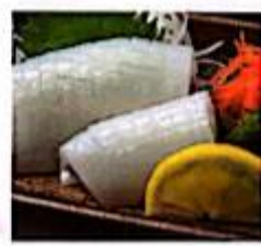
Squid 1475 yen