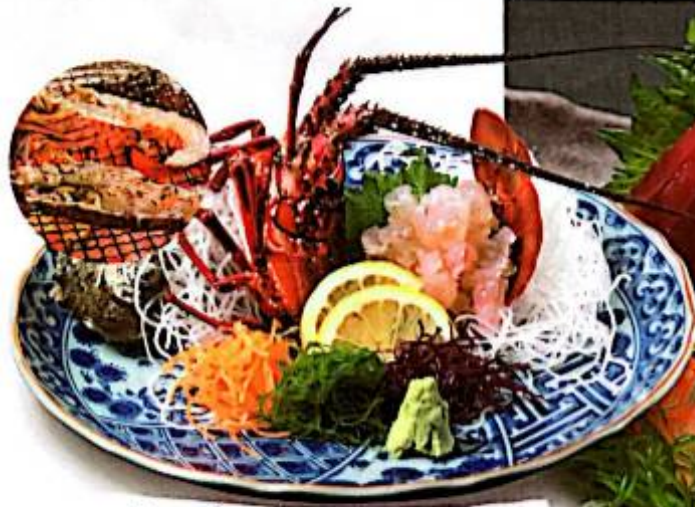
Lobster 3400 yen ~* Sashimi / grilled (soy sauce or salt)