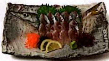
Sphyraenidae Sashimi 2040 yen