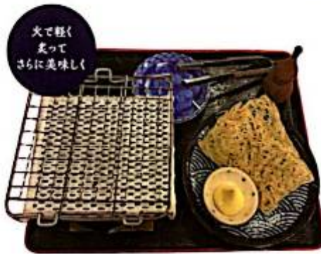
Dried whitebait sheet