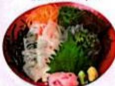
Sea bream/black bream and white bait Just a bowl 2040 yen Combo 2270 yen