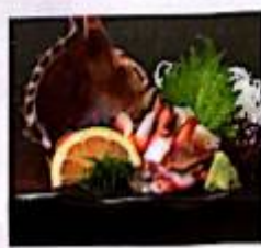
Conch shell 1135 yen

raw whitebait marinated with soysauce 740 yen