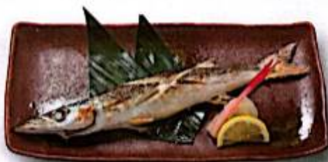
sphyraenidae 1820 yen Horse mackerel 1360 yen