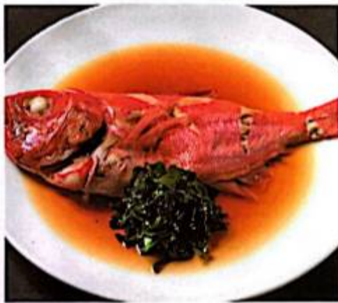
Simmered Red bream 3750 yen