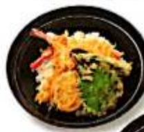
Assorted tempura Just a bowl 1700 yen Combo 1930 yen