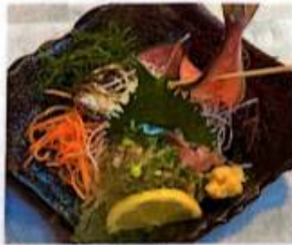
Sashimi of Horse mackerel 1705 yen