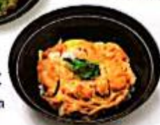
Pork cutlet Just a bowl 1475 yen Combo 1705 yen