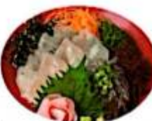
Flounder (Flatfish) and whitebait Just a bowl 2040 yen Combo 2270 yen