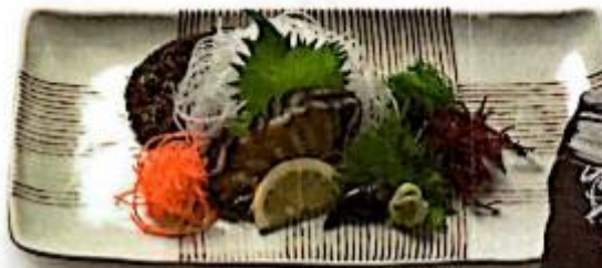
Abalone 2300 yen~*

Sashimi /live barbecue/steamed with sake/ grilled (soy sauce or soy sauce and butter)