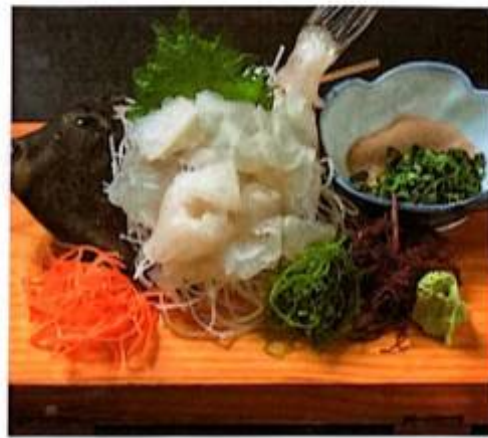
Sashimi of Filefish 2870 yen