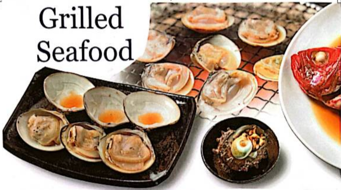
Clam (3 pieces) 1500yen