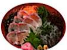
Great amberjack and whitebait Just a bowl 2040 yen Combo 2270 yen