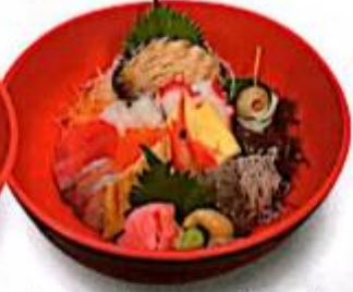
Assorted seafood With abalone