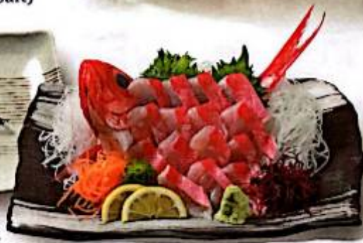
Red bream Sashimi 3180 yen

Sashimi /live barbecue/steamed with sake/ grilled (soy sauce or soy sauce and butter)