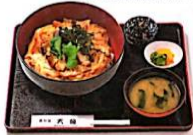
Sample of Enoshima-Don combo

Turban shell, onion and Japanese parsley covered with egg