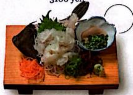
Filefish Sashimi 2300 yen