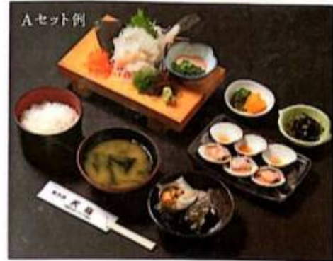
Sample of Sashimi of Filefish A combo