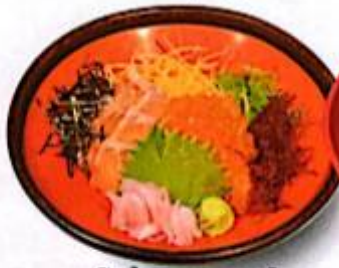
Salmon and salmon roe