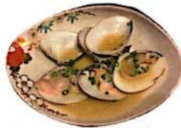
Sake-steamed clam with butter 1500yen