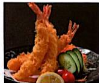
Fried shrimp 1950 yen