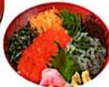
Salmon roe and whitebait Just a bowl 2270 yen Combo 2500 yen