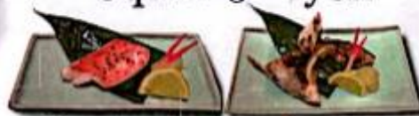
Alfonsino (Kyoto-style)1700 yen Greater Amberjack 1135 yen