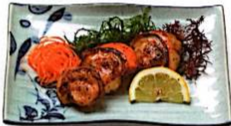
scallops (3pieces) 1380 yen