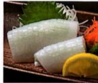
Sashimi of Squid 2045 yen