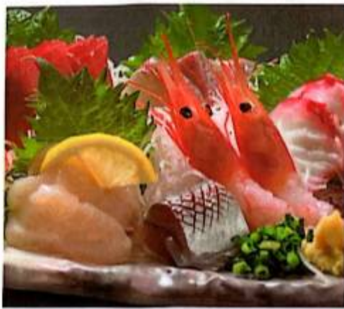
Assorted Sashimi 2270yen