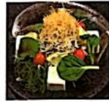
Whitebait and Tofu salad