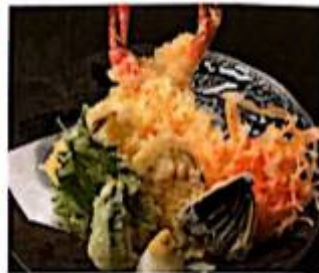
Assorted Tempura 1990 yen