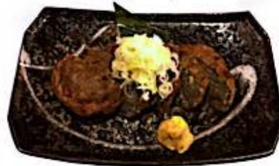
Deep-fried patty of fish paste 715 yen