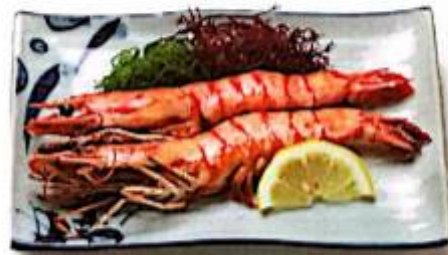
shrimps (2pieces)1140 yen