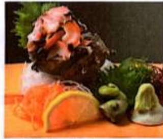
Sashimi of Turban shell 2045 yen