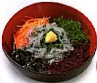
Raw whitebait Boiled whitebait Just a bowl 1080 yen Combo 1310 yen