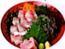
Sphyraenidae and whitebait Just a bowl 2040 yen Combo 2270 yen