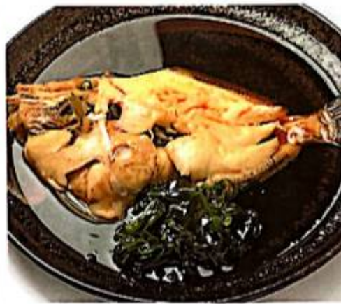
Simmered Filefish 2870 yen