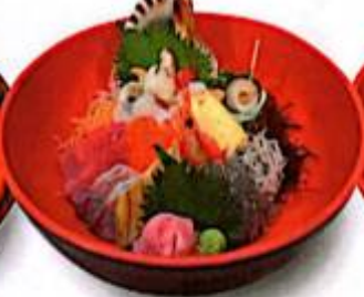
Assorted seafood With conch shell