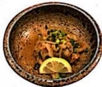
Deep-fried local fish marinated with spicy vinegar sauce 680 yen