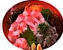
Red bream and whitebait Just a bowl 2270 yen Combo 2500 yen