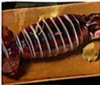
Grilled Squid 2070yen